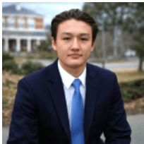
Dominic MacDonald Valley Property Management

Available for occupancy 9/1/2026, come see this clean and neat, bright one-bedroom, one bath apartment in a 5 unit apartment house. No carpets; gleaming hardwood in the living room and bedroom, vinyl in the kitchen and bath. Located just steps from downtown Northampton, what a fantastic location with easy access to public transportation, dining and [...]